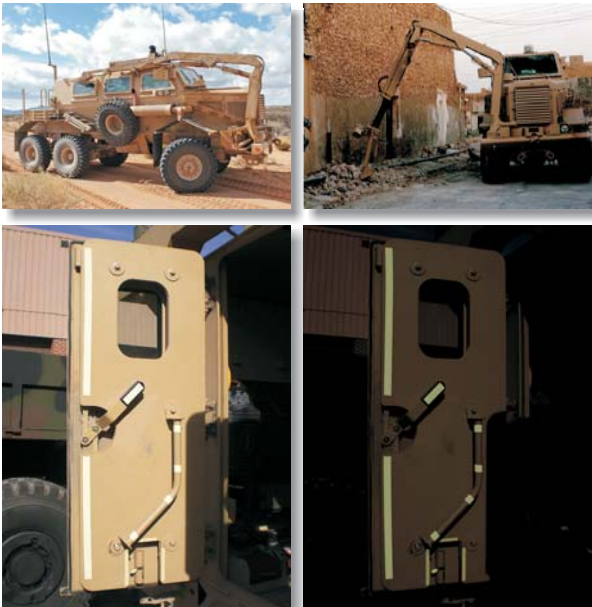
Left-rear door of Cat II Cougar shown for comparison.

When things go really bad and you've got to quickly orient yourself in a darkened vehicle and escape, clear and reliable safety and egress markings are vital.